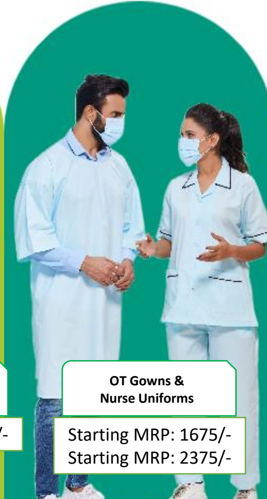
OT Gowns & Nurse Uniforms

Starting MRP: 1675/- Starting MRP: 2375/-