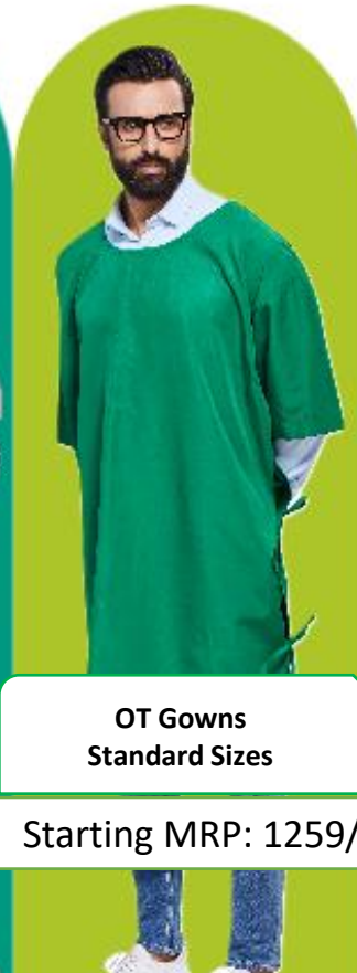
OT Gowns Standard Sizes