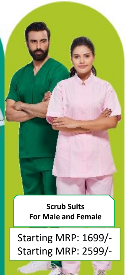
Scrub Suits For Male and Female

Starting MRP: 1675/- Starting MRP: 2375/-