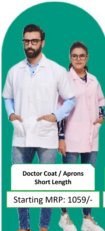
Doctor Coat / Aprons Short Length