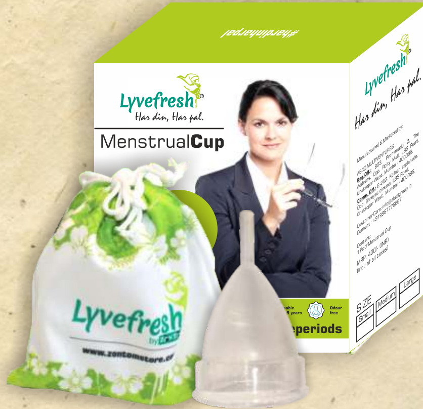
Lyvefresh Menstrual Cup (Large / Medium / Small) MRP 630