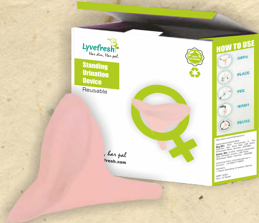
Lyvefresh Standing urination device for female MRP 630